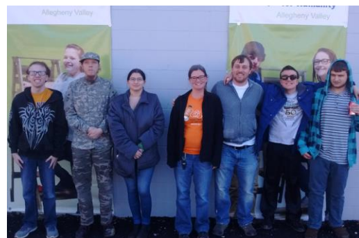
Family Services of SWPA volunteer day

The ReStore is always seeking groups and individual volunteers to help support the organization's efforts. If interested, visit the website at www.habitatav.org , call 724.337.8347, or stop in the ReStore for details.