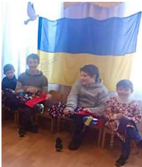
Children of the 645 m 2 of the preschool educational institution (orphanage) "Snowdrop" in the Lviv Region

These repairs will enable the orphanage to now focus on additional internal repairs that need to be completed, including work on the boiler units. While our mission focus is primarily focused on serving the Allegheny Valley, we found it a privilege to serve the children of Ukraine by providing support for roof repairs along with sharing messages of hope and support. We desire to continue relationships into the future with the orphanage and its children and to see them grow in a safe and healthy environment. Currently, we are in collaborative efforts with St. Vladimir Ukrainian Church to create an Easter raffle that will continue to benefit the orphanage and their efforts to replace a boiler system. Please stay tuned to more details on our website at www.habitatav.org .